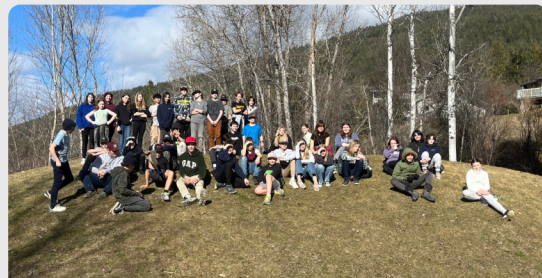
Grade 7's enjoying the sunshine at Schikurski Park